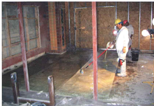
Workers apply a fiber reinforced polymer coating to the lobby floor.

"And then on top of the slab, they were required to add a layer of waterproofing membrane to prevent rain water or wash water leaking through the floor."