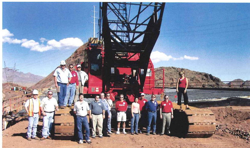
Centennial participants at Hoover Dam on April 29, 2005

award will be presented at the November gala banquet to CEEM graduates who have personally contributed toward engineering achievement, leadership and service to the profession and to the department. The department also plans to present centennial professor awards to four