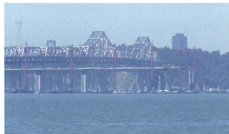
View of new bridge between Oakland and Yerba Buena Island.