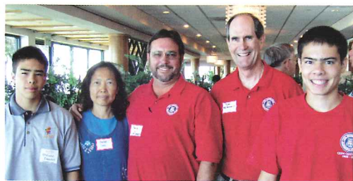
Some participants at an alumni luncheon in Emeryville, CA

Four distinguished alumni awards and one outstanding young alumni